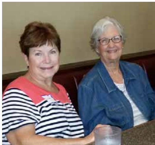
Jubilee on the Road Lake Lure and Lunch at La Strada September 18