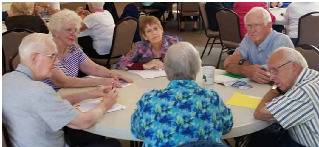
Senior Adult/Prime Time Fall Retreat Bonclarken Retreat Center October 11-12