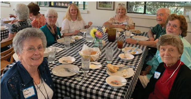
Jubilee/PrimeTime On The Road Lunch at Pisgah View Ranch September 17