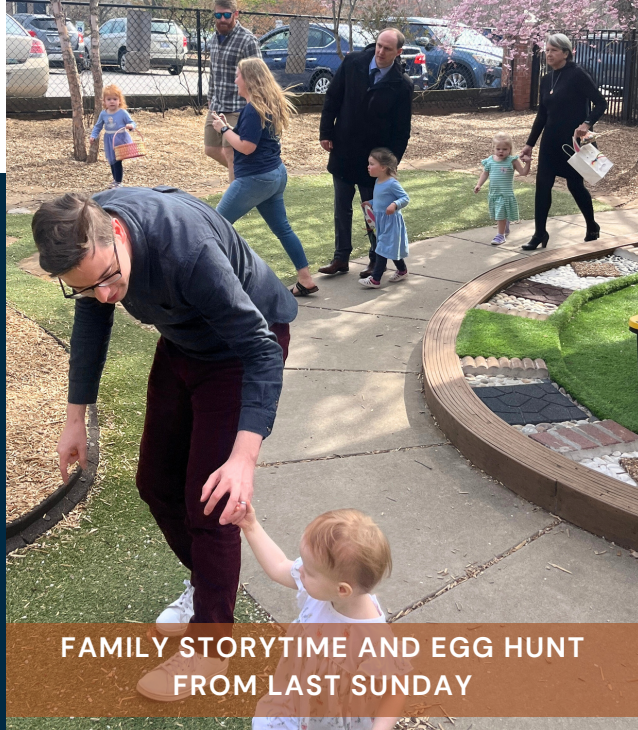
FAMILY STORYTIME AND EGG HUNT FROM LAST SUNDAY

If you are a guest with us today, greetings! We joyfully proclaim the sacred worth of all people and welcome you with glad hearts. Please complete a guest card from your pew and place it in the plate during the Offertory. We would love to connect with you.