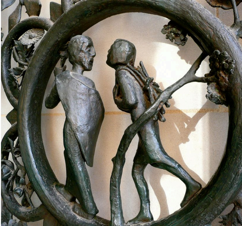
Sacrifice of Isaac, Washington National Cathedral

We welcome all guests worshipping with us today. Today is the Fourth Sunday in Ordinary Time. The season of Ordinary Time refers to the Sundays of the year that fall outside the periods of Advent, Christmas, Lent, and Easter. The word Ordinary refers to the ordinal numbers of each Sunday as we count the weeks between the Church's seasons. Ordinary time can be understood in terms of living out of the Christian faith and the meaning of Christ's resurrection in our day-to-day life. The color green represents the life and growth of the church and its ministry.